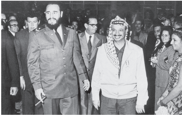
Fidel Castro with Yasser Arafat

Palestinian Liberation Movement at its founding in 1964 and to aid leftist organizations such as the PFLP and the Democratic Front for the Liberation of Palestine (DFLP) with logistical and professional aid. In 1974, Fidel Castro hosted PLO Chairman Yasser Arafat on an internationally-covered visit to Cuba, and then established a Palestinian embassy in Cuba.