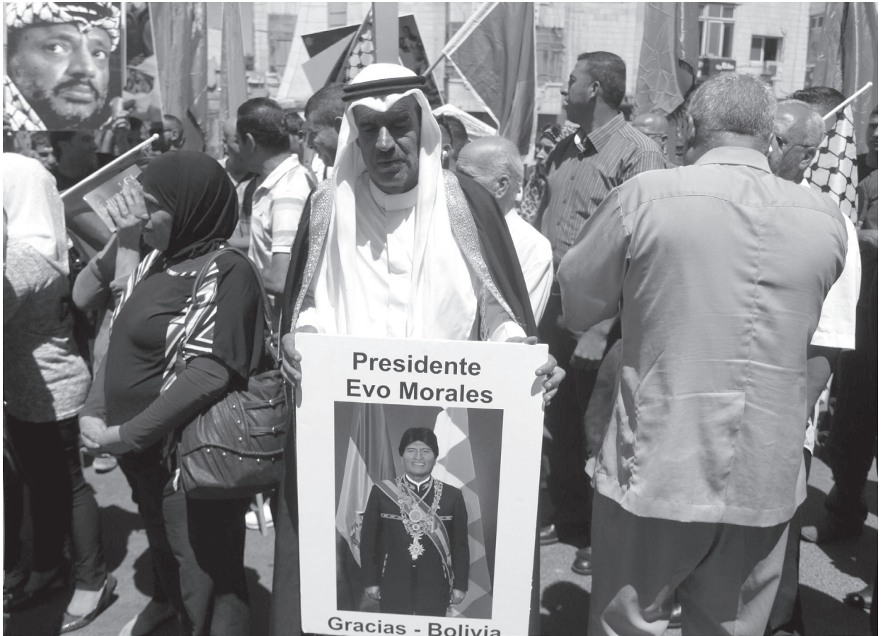
A Palestinian man in Ramallah holds a poster of Bolivian President Evo Morales during a 2014 rally in support of Latin American leaders.

revolutionary movements was based on the premise that the Global South has the ability to fight and win—that guerilla warfare can succeed despite all limitations and pressures. “We had deeply studied the experiences of Latin American revolutionary movements on two levels—the ideological level, and the level of the detailed specificities of the experience in its context,” said the former PFLP leader. “We were fascinated with the Guevarian path and it affected our thinking. It constituted an inspiration—yet, we were aware of the limitations of its applicability in the Palestinian context. The Palestinian topography is limited, as we do not have mountains.” This suggests that the activists of the Palestinian leftist organizations drew ideological inspiration from Latin American revolutionary movements, but had analyzed the specificities of the Palestinian case and assessed which revolutionary practices fit the Palestinian context and which were less applicable.