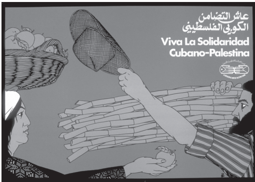
“Long Live Palestinian-Cuban solidarity!” Reads a PFLP poster in Arabic and Spanish

with the details of his revolutionary praxis. The fact that most students were familiar with the mythology of Che’s portrait but knew nothing of his revolutionary essence says volumes about how his memory, and the memories of other revolutionaries, have been flattened, shifted into empty signs.