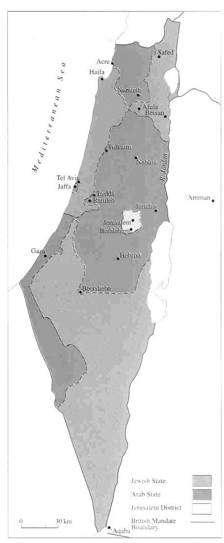
The United Nations partition plan, 29 November 1947